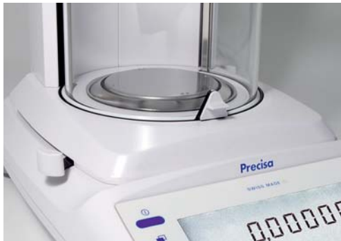
Round, ambidextrous draftshield for optimum conditions