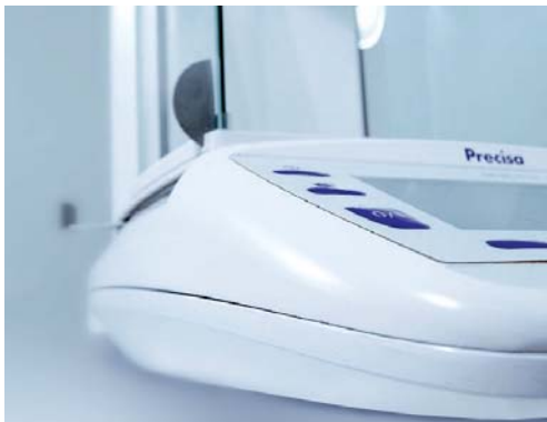
Designed along smooth, flowing lines