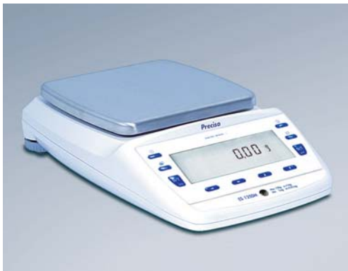
Compactly styled shape