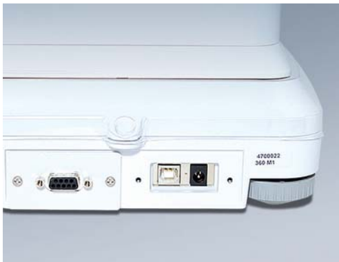
Advanced, multipurpose connectivity