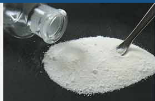
Sugars and Sweeteners