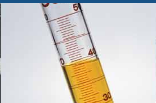
Essential oils, Flavors and Fragrances