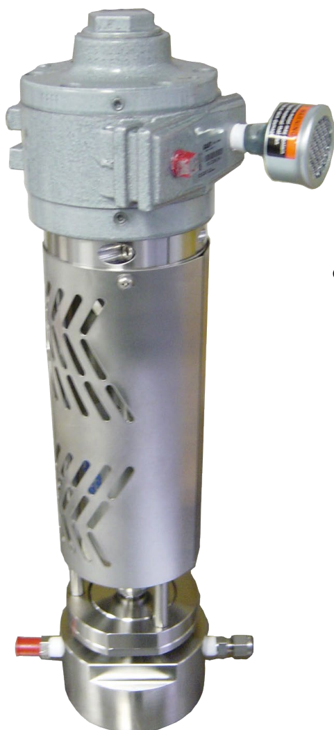
Parr Agitator on Teledyne Isco Pump

The standard cap on top of the syringe pump is exchanged for an alternative cap that accommodates a Parr magnetic drive. This rotating drive is powered by an air motor at speeds up to 1700 rpm and is surrounded by a protective shield. The custom-designed Teledyne Isco impeller is coupled to the Parr magnetic drive to provide agitation to the fluid below.